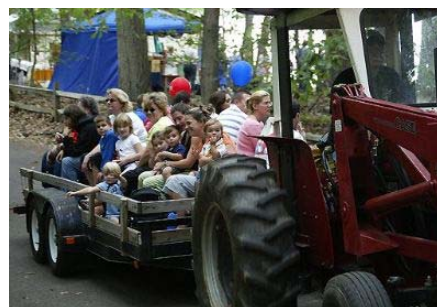
Gazette File Photos Folks take a wagon ride down to the nature center at last year's Piney Run Apple Festival.